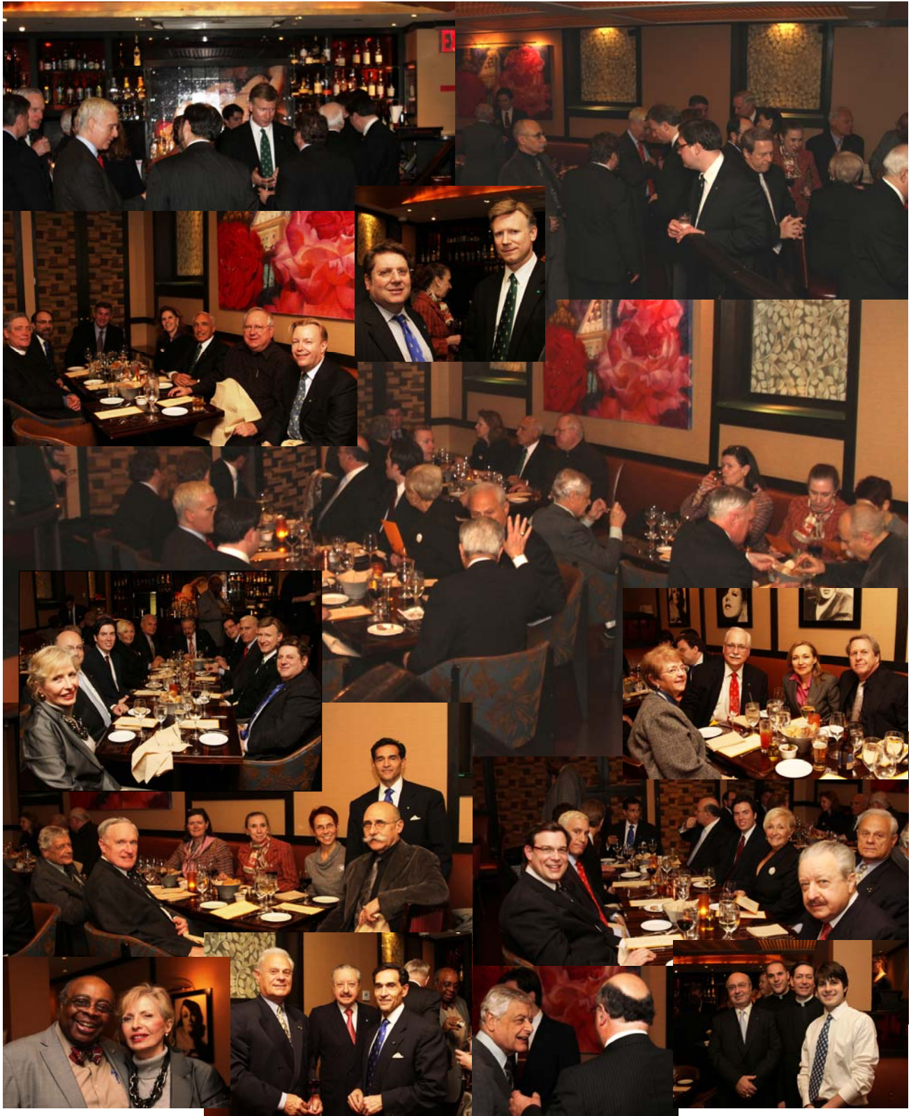
Members, friends and guests enjoying dinner after the Mass at North Square Restaurant, New York City