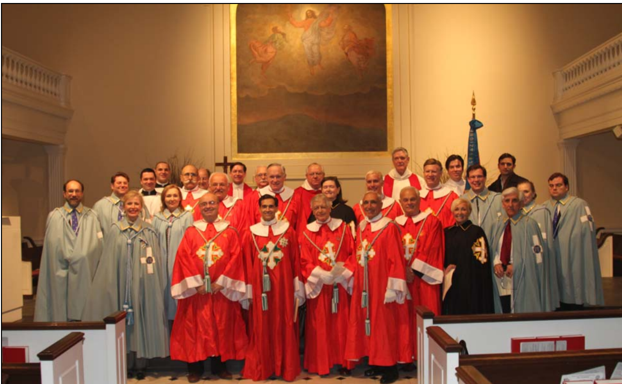
Members of the Delegation of Savoy Orders assemble for a group photo after the Mass