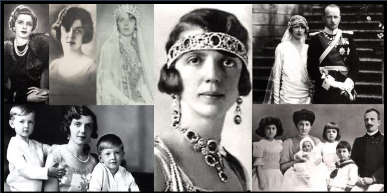
HRH Princess Mafalda of Savoy, Landgravine of Hesse-Kassel (1902 - 1944)

Along with the memory of Their Royal Highnesses, the intentions of the Holy Mass were also dedicated to Her Royal Highness Princess Mafalda of Savoy, who met a tragic death in the Nazi concentration camp in Buchenwald on 28 August 1944. The second daughter of King Victor Emmanuel III of Italy and Queen Elena of Montenegro, Princess Mafalda was born in Rome and inherited a love for music and the arts from her mother, accompanying her on visits to Italian military hospitals during the First World War. In 1925, she married Prince Philipp, the Landgrave of Hesse-Kassel, with whom she had four children.