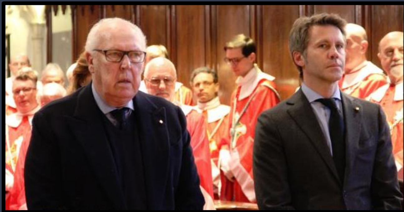
HRH Prince Victor Emmanuel of Savoy with his son HRH Prince Emmanuel Philibert of Savoy